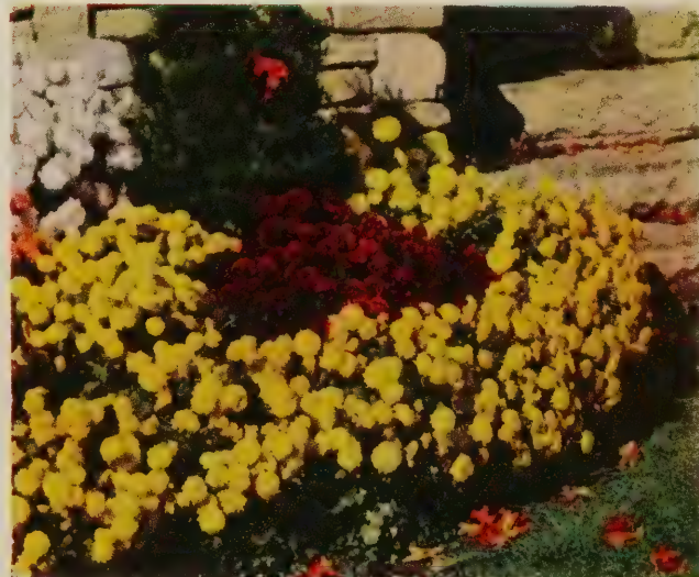
GOLDEN MOUND. 50c each; 3 for $1.25